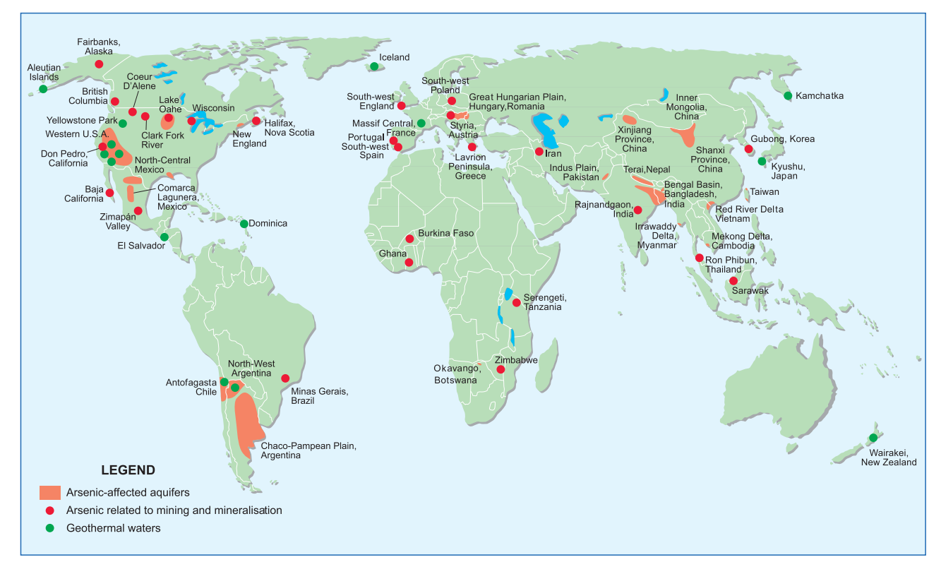
Figure 1. Distribution of documented arsenic problems in groundwaters and surface waters (>50 \mu g/L). Includes known occurrences of geothermal and mining-related arsenic problems (after Smedley and Kinniburgh, 2002)

Arsenic problems have been recorded in sulphidemining and mineralised areas in many parts of the world, including many well-documented cases in the USA, Canada and Europe (Figure 1). Comparatively few have been linked directly with identifiable health problems but exceptions include the Ron Phibun area of peninsular Thailand (Williams et al., 1996), Rajnandgaon district in Madhya Pradesh, India (Chakraborti et al., 1999) and a recently documented case in Burkina Faso (Smedley et al., 2007).